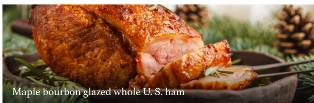
Maple bourbon glazed whole U. S. ham